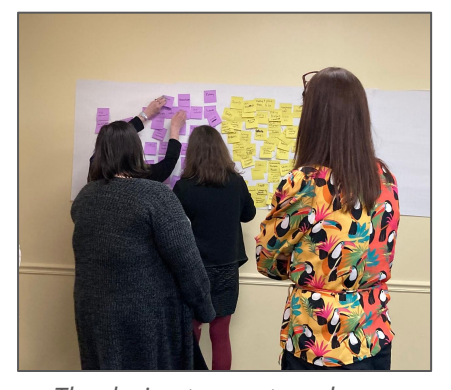
The design team at work on a partner mapping exercise

Share the plan with the community. Begin implementation planning for Year 1