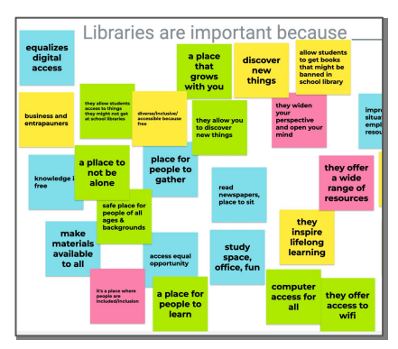
An online Jamboard allowed for virtual brainstorming