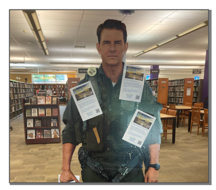
We enlisted a Top Gun to advertise the community meeting