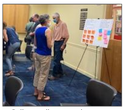
Gallery walks - attendees gave feedback on ten key questions