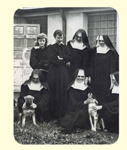
HISTORY AND LEGACY OF THE BASILIAN SISTERS IN FOX CHASE Tuesday, Sept. 17, 7 p.m.