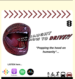
WHO TAUGHT YOU HOW TO DRIVE?! Wednesday, Oct. 2, 7 p.m.