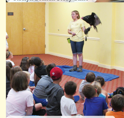
Family Fun Night with Briar Bush