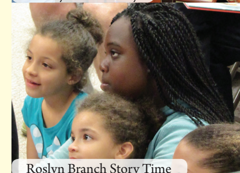
Roslyn Branch Story Time