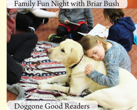
Doggone Good Readers