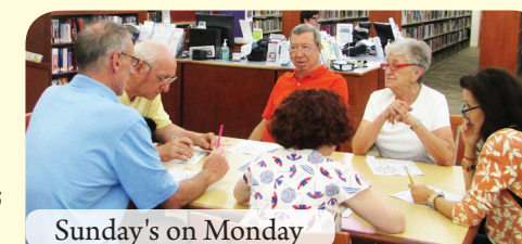
Sunday's on Monday