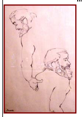
"Very Hot" by Susan Cohen

Steady money? The people? Surely all of these things make our library a wonderful workplace. I think there may be something more than fine-free status that the library offers its staff. It's the exhilaration of working in a building filled with ideas.